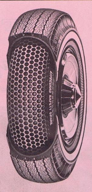
LIFEGUARD Safety Spare